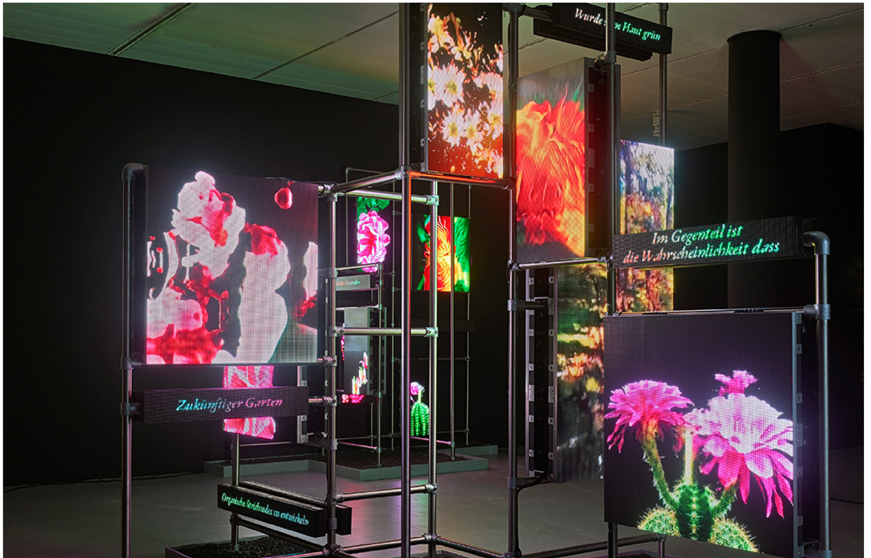
Pic. 6: Installation View, K21, I Will Survive: Hito Steyerl, Power Plants, 2019, Kunstsammlung Nordrhein-Westfalen, 2020, Photo: Achim Kukulies, © VG Bild-Kunst, Bonn, 2020.