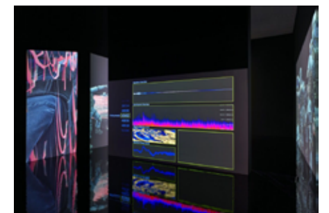
Pic. 2: Installation view K21, Hito Steyerl. I Will Survive: Hito Steyerl, SocialSim , 2020, Photo: Achim Kukulies, Kunstsammlung Nordrhein-Westfalen, 2020, © VG Bild-Kunst, Bonn, 2020 #HitoSteyerl #K21.