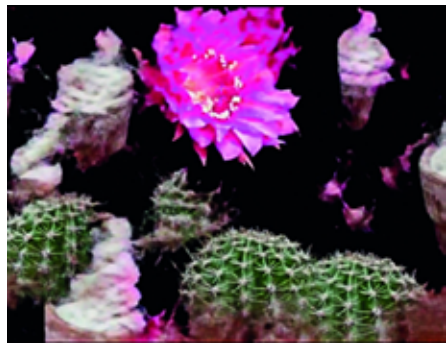
Pic. 4: Hito Steyerl, Power Plants, 2019, Photo: Serpentine Gallery.

In this two-part installation exploring the ability (or rather inability) of artificial intelligence to make predictions about the future, promises made by machine learning begin to seem very much like magic and alchemy. In the main film, a female voice introduces herself as a neural network that is constantly predicting the future. The narrator proceeds to tell the story of the Kurdish woman Hêja, who served time in prison, where she planted a garden in the future. The garden was full of plants with magical, healing powers that can be used to poison autocrats, or to make you immune to hate and propaganda on the Internet. The narration is accompanied by a deluge of kaleidoscopic images that seem to be constantly overwriting and foreshadowing the next image.