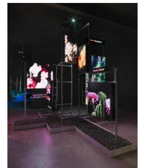
Pic. 5: Installation View, Serpentine Galleries, Hito Steyerl, Power Plants, 2019, Photo: Esther Schipper Gallery.

In general, it was noticeable at the exhibition that one needed a lot of time during the reception. Steyerl, however, plays with the over-reaction in reference to the flood of images of the digital culture. A digital perception competence helps us to receive and understand such exhibition situations.