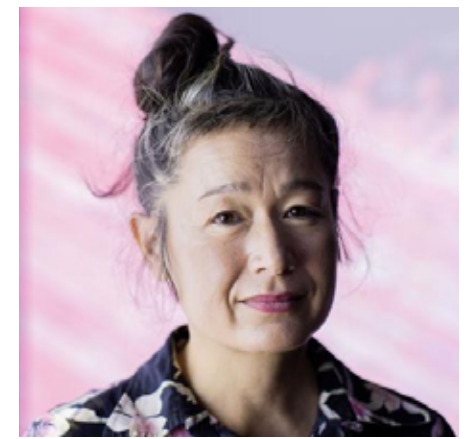
Pic. 1: Hito Steyerl